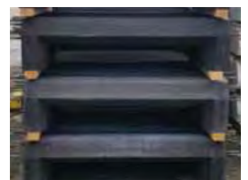
Charcoal and other colours are available upon request