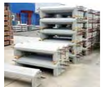
Plentiful supplies available