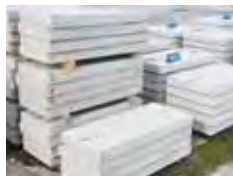
SIDE ENTRY PRECAST CONCRETE COVERS