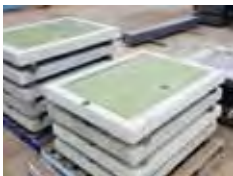
SIDE ENTRY GRIDLITE COVERS