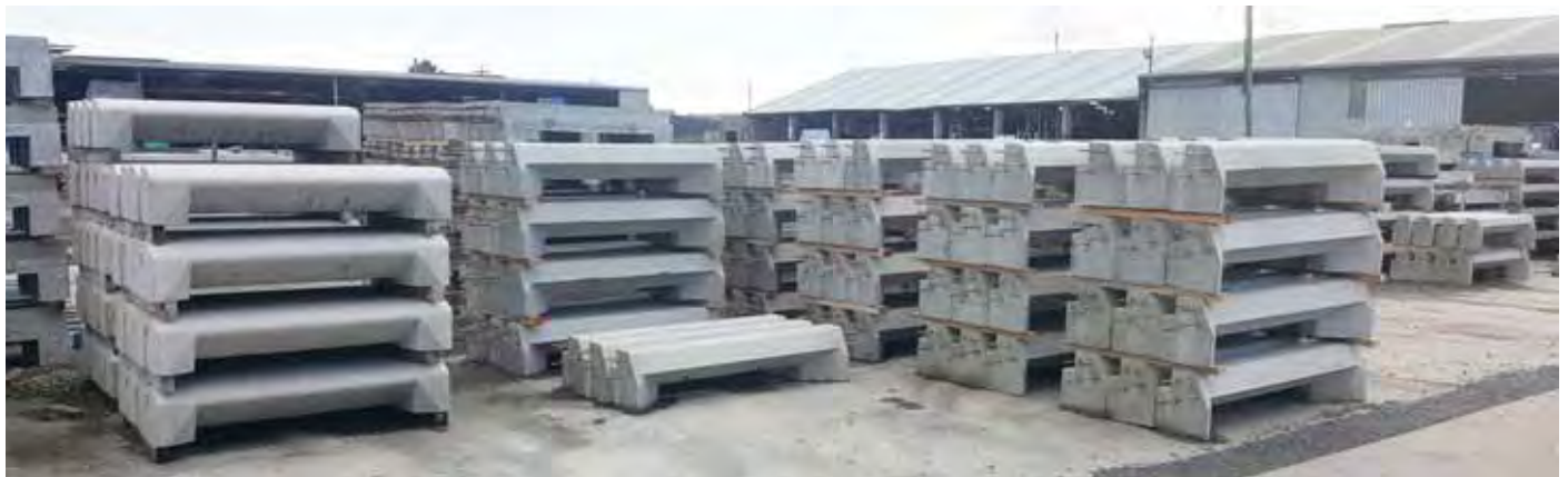
Frankston rollover kerb lintels, Casey barrier kerb lintels and various other kerb lintels stocked in the factory.