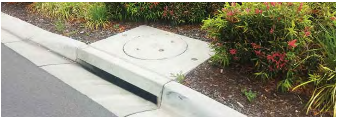
Barrier profile kerb lintel with concrete cover frame and insert, post installation in Chirnside Park