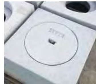
Sewer inspection point and cover